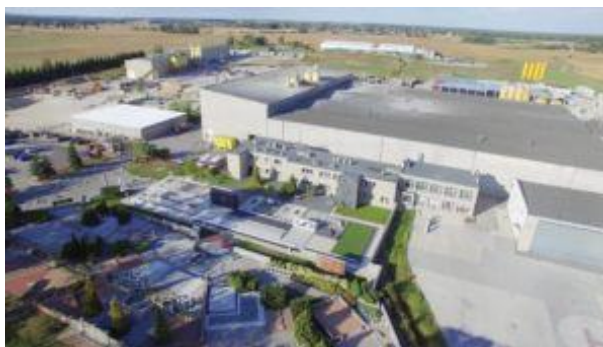
Fig. 1. A view of the Etex Poland Sp. z o.o. production hall in Sobota (Poland).

Etex Poland Sp. z o.o. is a Polish manufacturer of broad range of construction products with nearly 35 years of experience in the production of concrete prefabricated elements. The company established in 1985, gradually transformed from a workshop into manufacturing company possessing machine parks in 5 factories in central, north-western and western Poland.